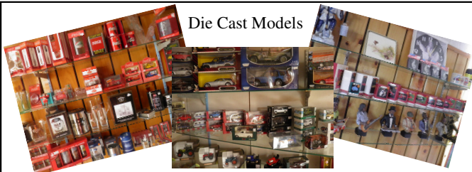
Die Cast Models