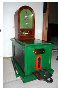
Main view of No. 6 instrument showing the restoring lever and the tablet tray in the "out" position

With advances in electrical locking of the lever frame within the signal box, the tablet instrument also electrically locked the section signal lever. This was marked with a white stripe on the red background.