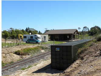
RailCruiser Storage at Mamaku Station and earthworks being undertaken in the background for the carpark

We have completed the installation of two 40 foot containers positioned back to back with the ends cut out to provide secure storage for the first eight RailCruisers. At one end we can back up and load RailCruisers directly onto our road trailer and the other end is linked to the main line through a turntable.