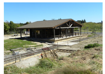
Completed Mamaku Station with secondary track waiting to be ballasted