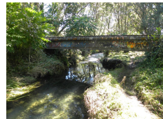
One of three bridges on the Family RailBiking section of the line between Rotorua and Ngongotaha

Then there will be more work to achieve approval to operate both RailCruising and RailBiking on the Tarukenga to Rotorua section of the track, which includes getting signoff for our road crossing procedures.