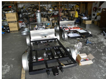
RC2 and RC3 at Ikon Engineering nearly completed and waiting for body

This photo is of progress with the construction of RC2 and RC3 at Ikon Engineering. Ikon has almost completed installation of all sub assemblies, components and powertrain to the chassis.