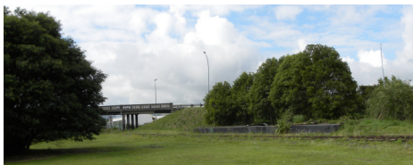
Old Rotorua Railway Station site at Lake Road with the overbridge to be removed in the background

We are presently in the design stage for a high profile Rotorua Railway Station with an information and booking office on Lake Road at the site of the last Rotorua Railway Station.